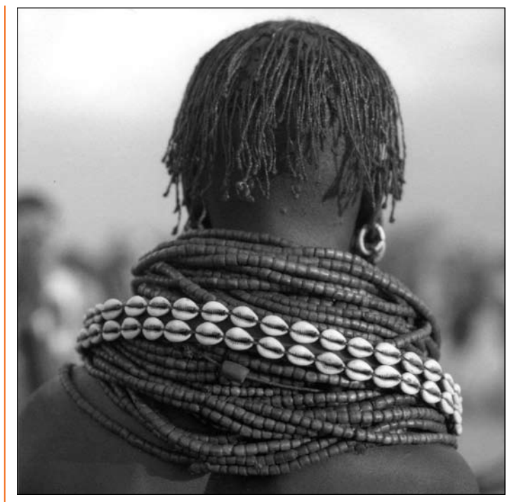
A woman from the Omo Valley.

We might not be educated, but we know, we know what is going on. The government people start explaining to us about the dam. Talking smoothly, trying to convince us, but they have already started the project. And when we follow everything they say from their mouths, we realize they are cheating us. They are taking this river to sell the hydroelectric power. Without knowing us the government continues doing their business and is ready to sell this river and they are feeding and raising their children with that money, but what about us? What about our children? The government is lying to us. They tell us "there are rumors," and to not believe what the ferenji (foreigners) say.