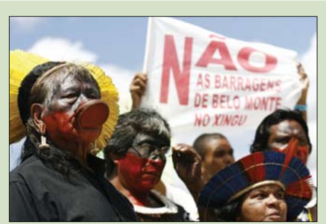
Indigenous leaders protested Belo Monte Dam in February.

The project would be built by Brazilian firm Camargo Correa. China originally expressed interest in funding the project, but does not seem to be involved in it at this time.