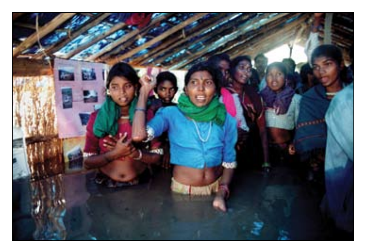
The Narmada struggle in India empowered rural women like these to stand up to big dams that would drown their communities.

Large dams lead to massive shifts in the ways in which men and women access and control resources across a river basin. In some cases, women might gain access to markets and urban facilities that were not available to them prior to resettlement, thus enhancing their set of economic choices and activities. Positive gender impacts can result from an increased or improved supply of water or electricity that can result from a large dam. How-